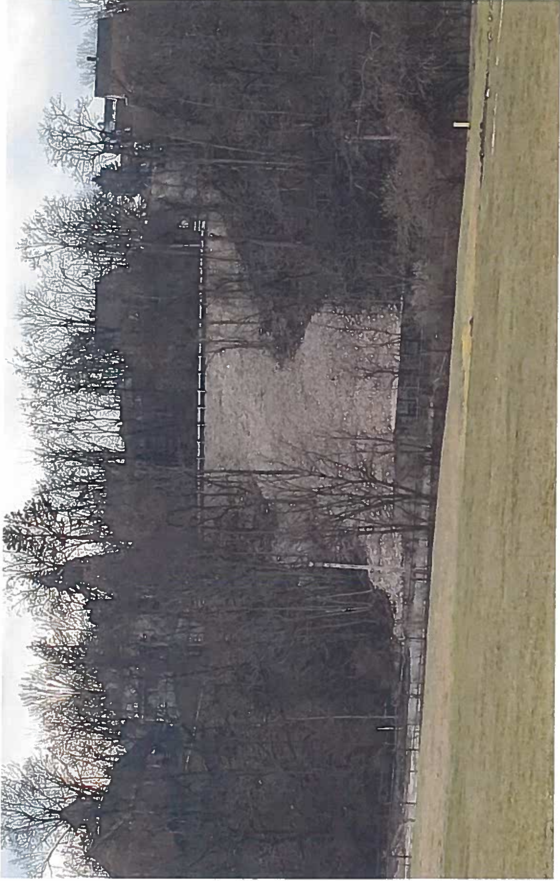
Griffith Slide Repair from Jefferson Ave. Park