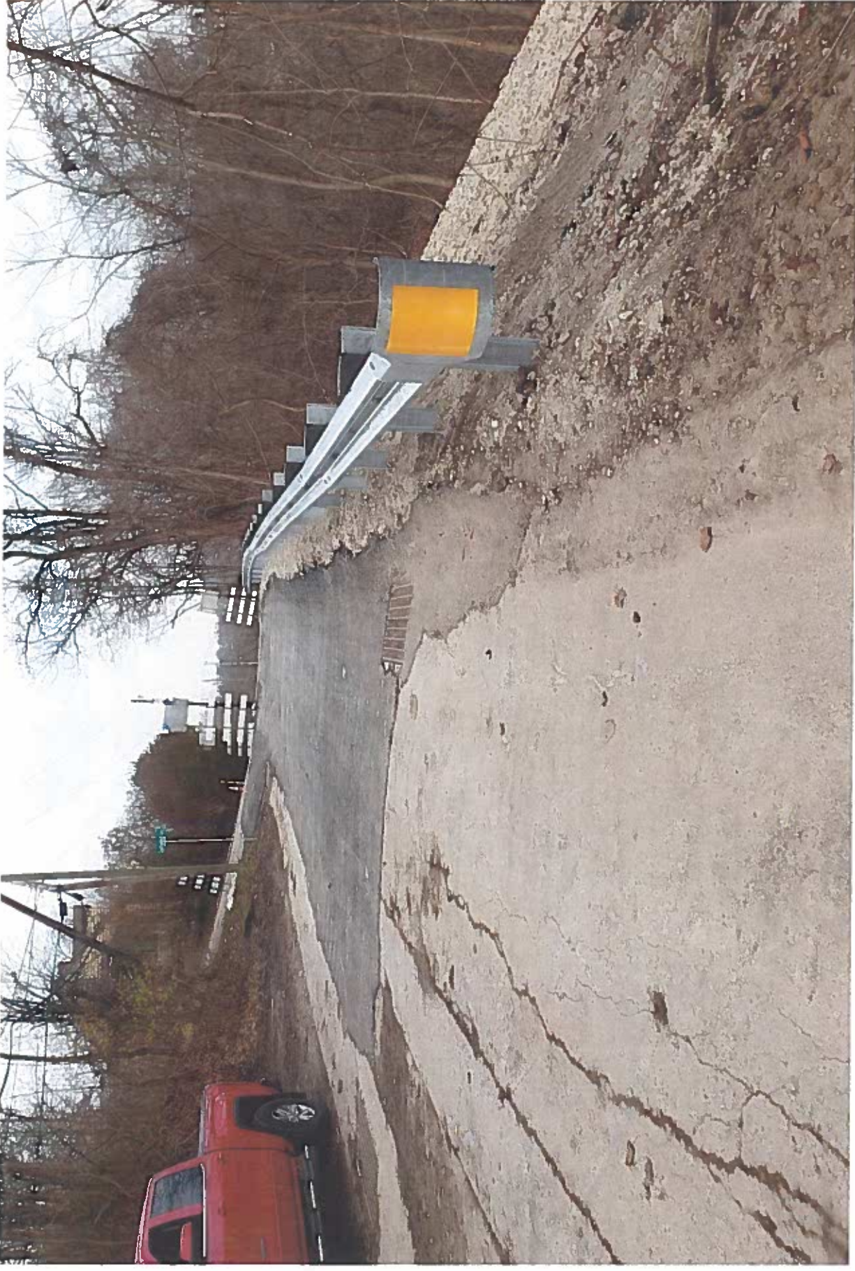
Griffith Street Slide Repair