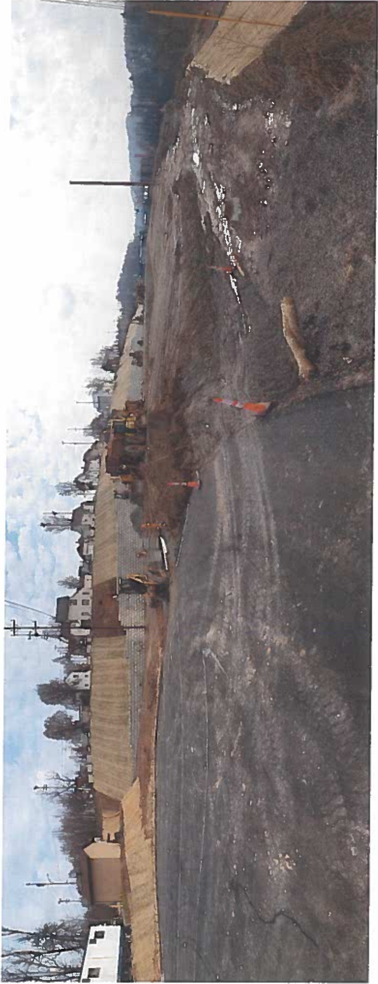
Running Brook - Access Road Installed, Storm sewer installed, Building pad on grade, and retaining wall complete.